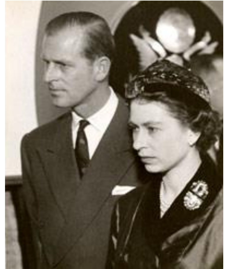
The Queen and the Duke of Edinburgh visiting William & Mary in 1957 for the 350 th anniversary of the founding of Jamestown.