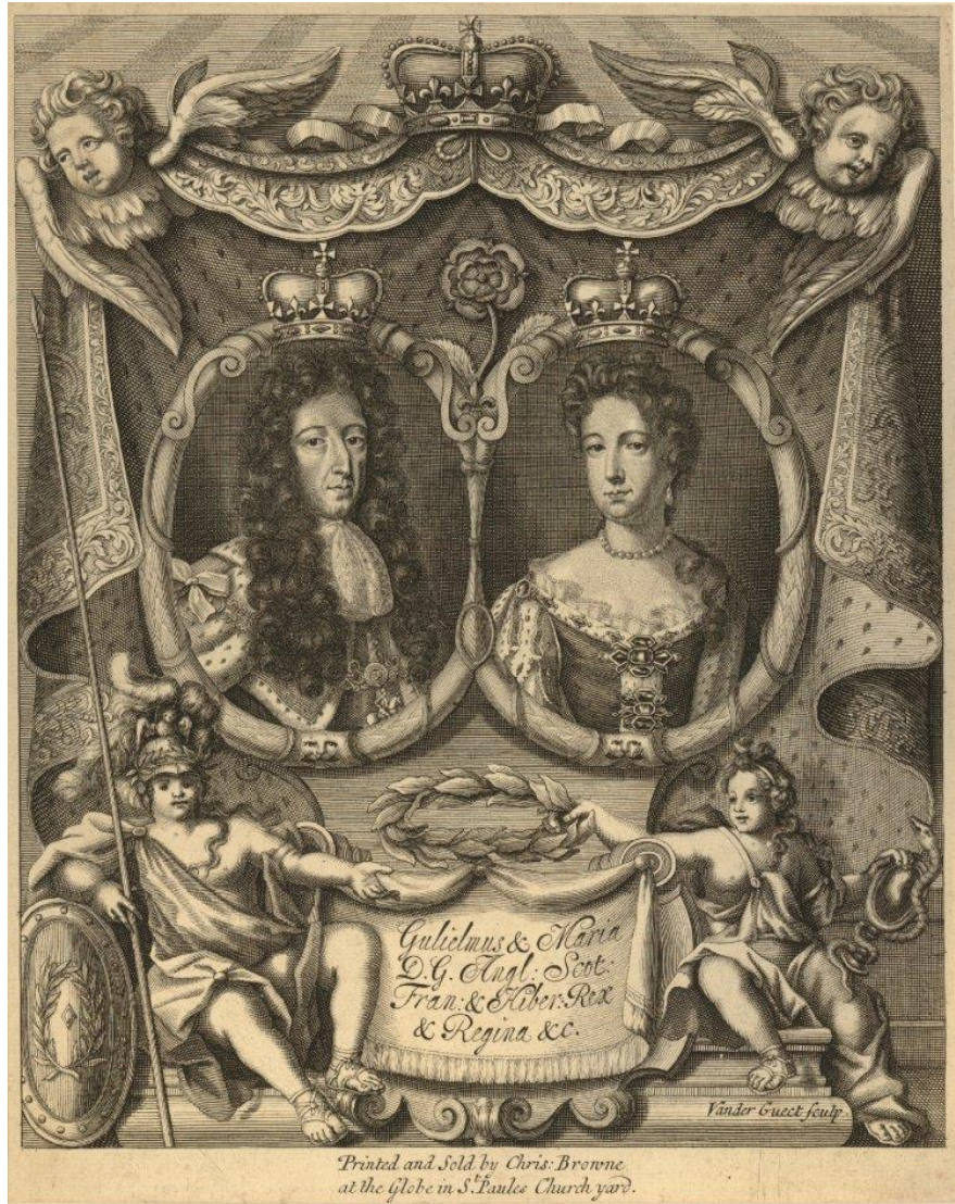
Double portrait of William III and Mary II c. 1690.