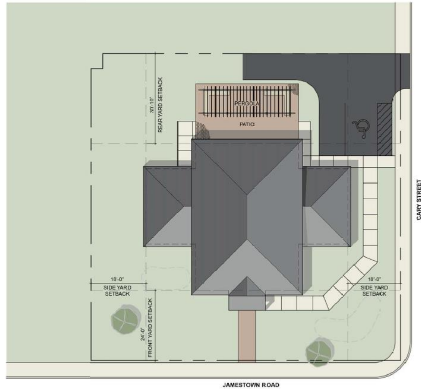
Site Plan September 18, 2017

Shenkman Jewish Center William and Mary Real Estate Foundation