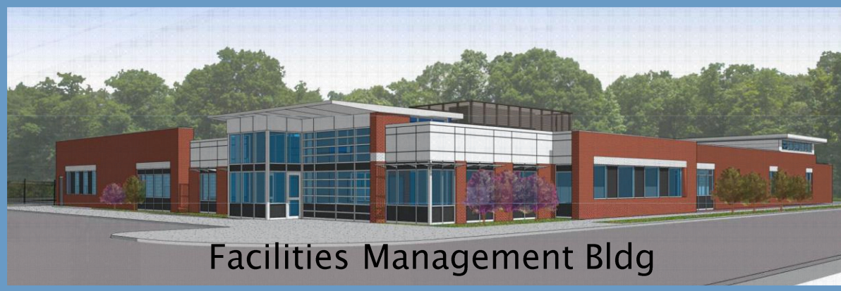
Facilities Management Bldg