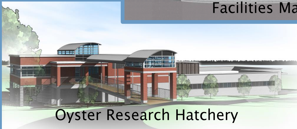
Oyster Research Hatchery