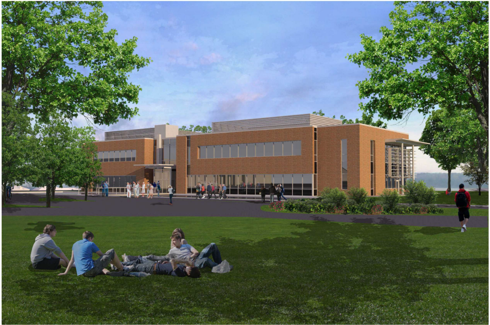
PERSPECTIVE LOOKING SOUTHWEST