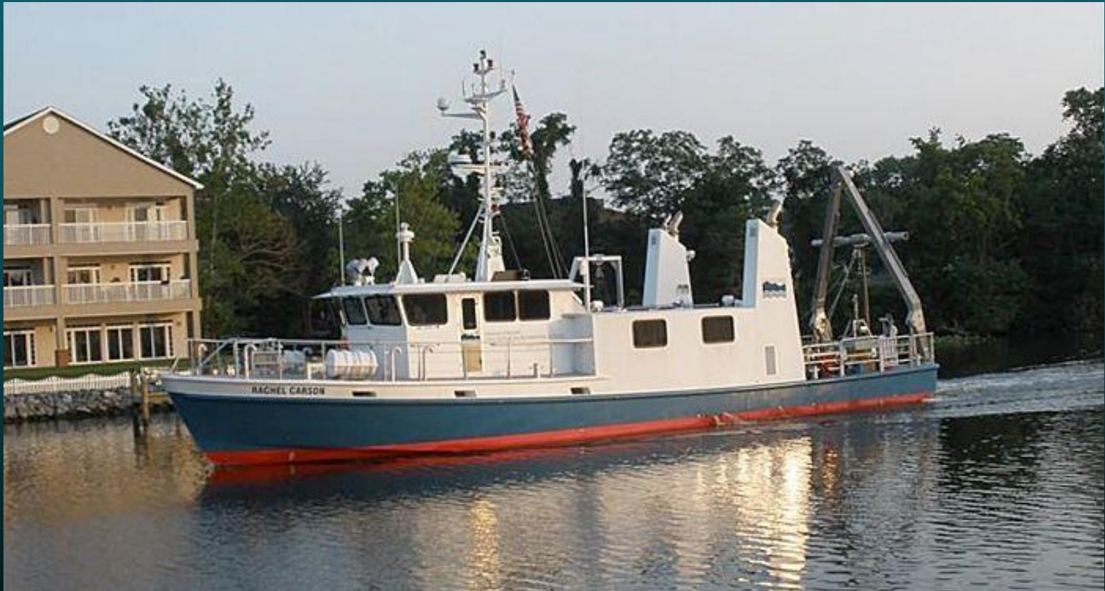
R/V Rachel Carson – UMCES – 81 Ft.