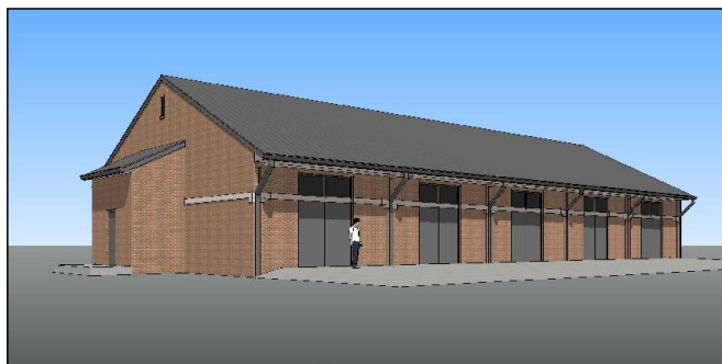
PROPOSED NEW RESEARCH STORAGE BUILDING