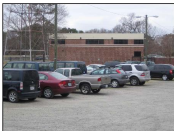
VDOT TOLL PLAZA BUILDING (VIEW OF PROJECT SITE)