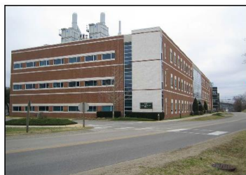
CHEASPEAKE BAY HALL