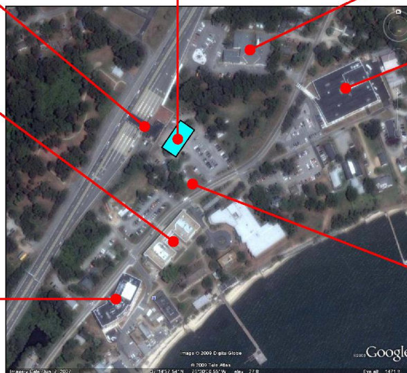
AERIAL VIEW OF VIMS CAMPUS