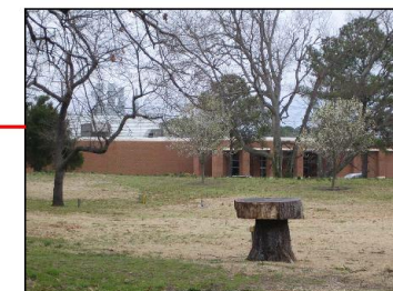
SEAWATER RESEARCH LAB