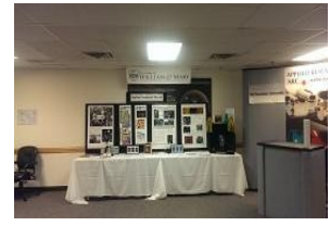
Jefferson Lab Open House