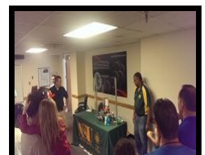
NSU's vacuum demonstration featured a shrinking marshmallow and expanding shaving cream.