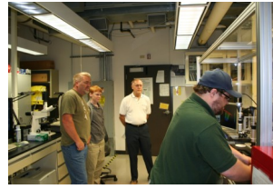
Boy Scout Visit