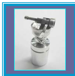
This is an example an injection needle that we had to install in the Scanning electron microscope for analysis. Due to the unusual shape of the object, we used aluminum foil to hold it on the sample holder.