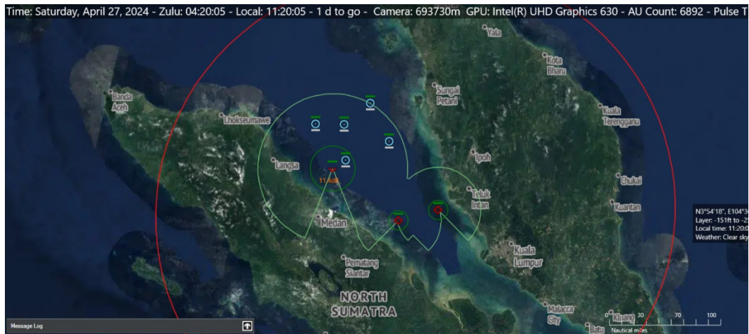
Move 3: U.S. blockade of PRC bound shipping through Straits of Malacca