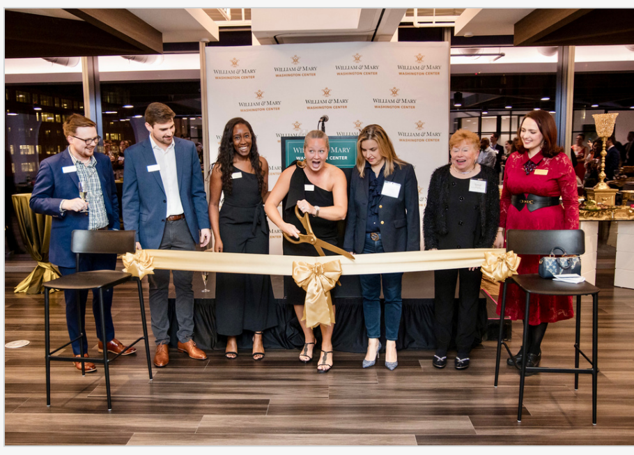
Washington Center Grand Opening Ribbon Cutting, Oct. 21, 2022

We look forward to welcoming everyone in the William & Mary community to the Washington Center in 2023!