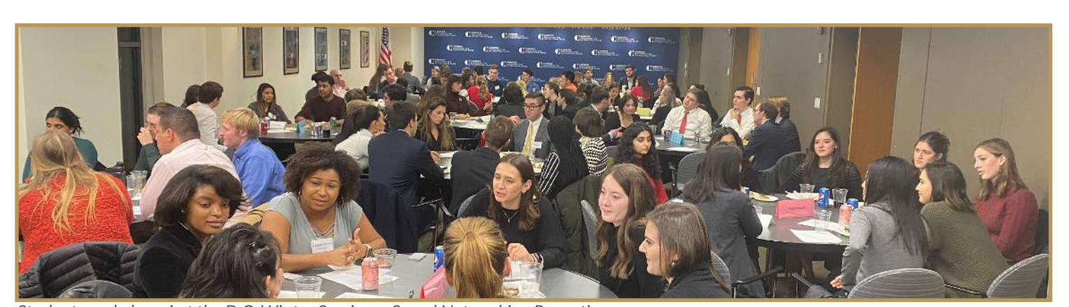
Students and alumni at the D.C. Winter Seminars Speed Networking Reception