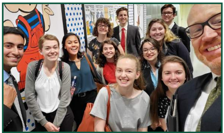
2020 News & Media students at the Entertainment Software Association

In response to the 2020 COVID-19 pandemic, the D.C. Summer Institutes moved to a completely online format, including remote internships. The two-week speaker/site visit course was conducted via Zoom and included the same opportunities as it would in-person, thanks to our gracious alumni and talented faculty.