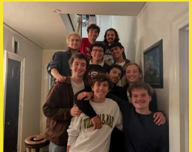
(From Top to Bottom: Fall Tour, Homecoming Concert, Alumni Event)