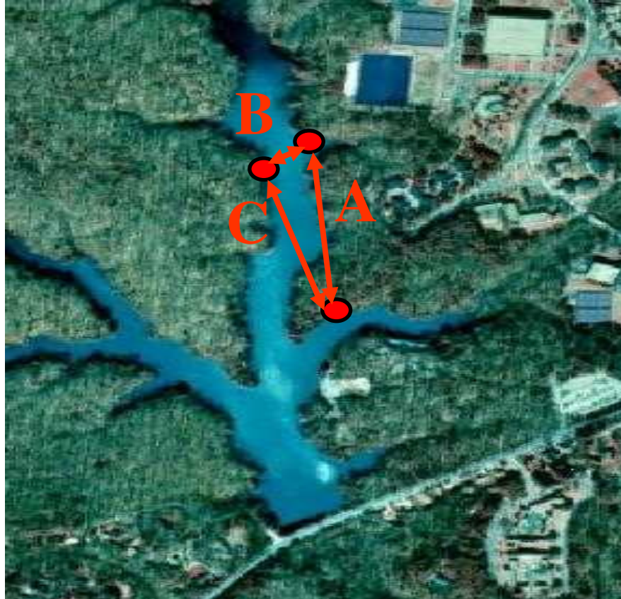
Figure 1. Map of Lake Matoaka showing three trapping sites separated by distance and/or depth.