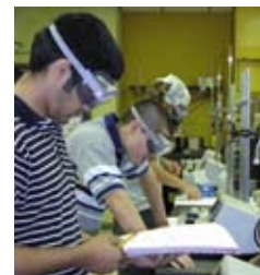
151 Lab is fun!

The rising cost of higher education is making it far more difficult for highly talented individuals to attend the college of their choice. Annual giving or endowments to support undergraduate scholarships will allow us to remain more competitive in attracting such talent. The creation of endowments for maintaining stipends for Master's level students would be very beneficial as well.