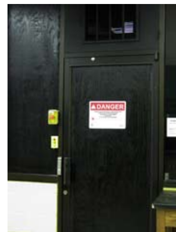
The entrance to our new laser lab. (Since it's unlikely that any of you is wearing appropriate laser goggles, safety concerns prevent us from giving you a look inside for now.)