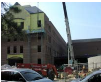
The Landrum Drive side of the ISC in mid-August; the loading dock juts out on its right.

This new 100,000 square feet building will give not only the Chemistry department but the Biology and Psychology departments state-of-the-art laboratories and better opportunities for cross-collaboration of the three departments. Much of the cost for this new building as well as for the renovation of Rogers Hall comes from state appropriations and bond