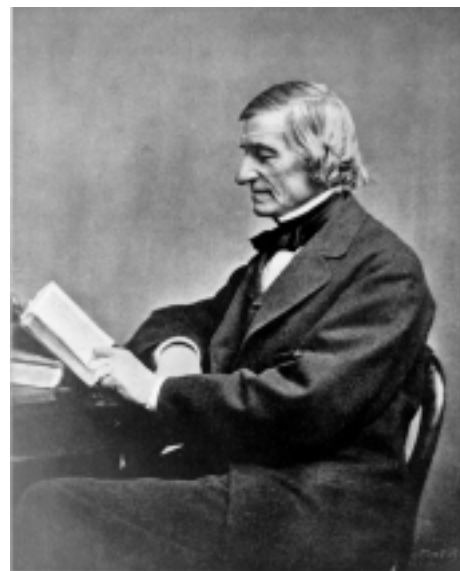
William Barton Rogers, in an undated photograph from the College's archives.