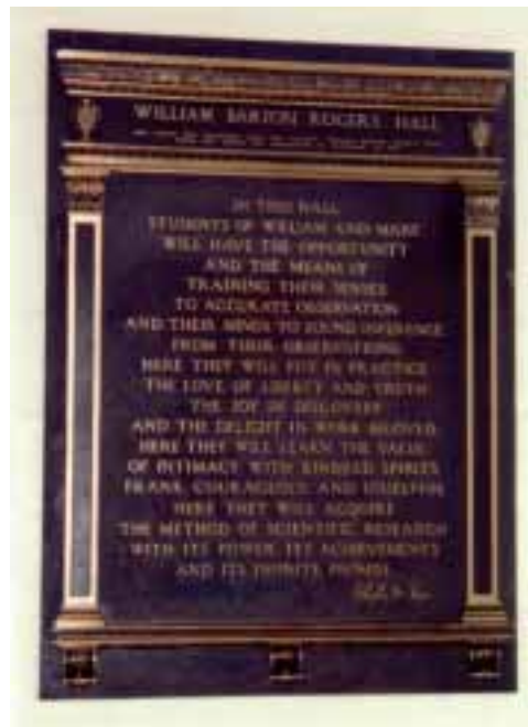
This brass plaque hung for years in Old Rogers Hall and was relocated to New Rogers upon its completion.

A more detailed account of Rogers' life and activities may be found in the several sources found in the Dictionary of American Biography (Scribner) from which much of this account was extracted. An interesting account of MIT is found in the International Dictionary of University Histories (Fitzroy Dearborn).