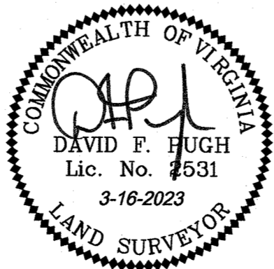
EXHIBIT SHOWING LEASE LOTS ACROSS THE PROPERTY OF RICHARD BLAND COLLEGE OF THE COLLEGE OF WILLIAM & MARY