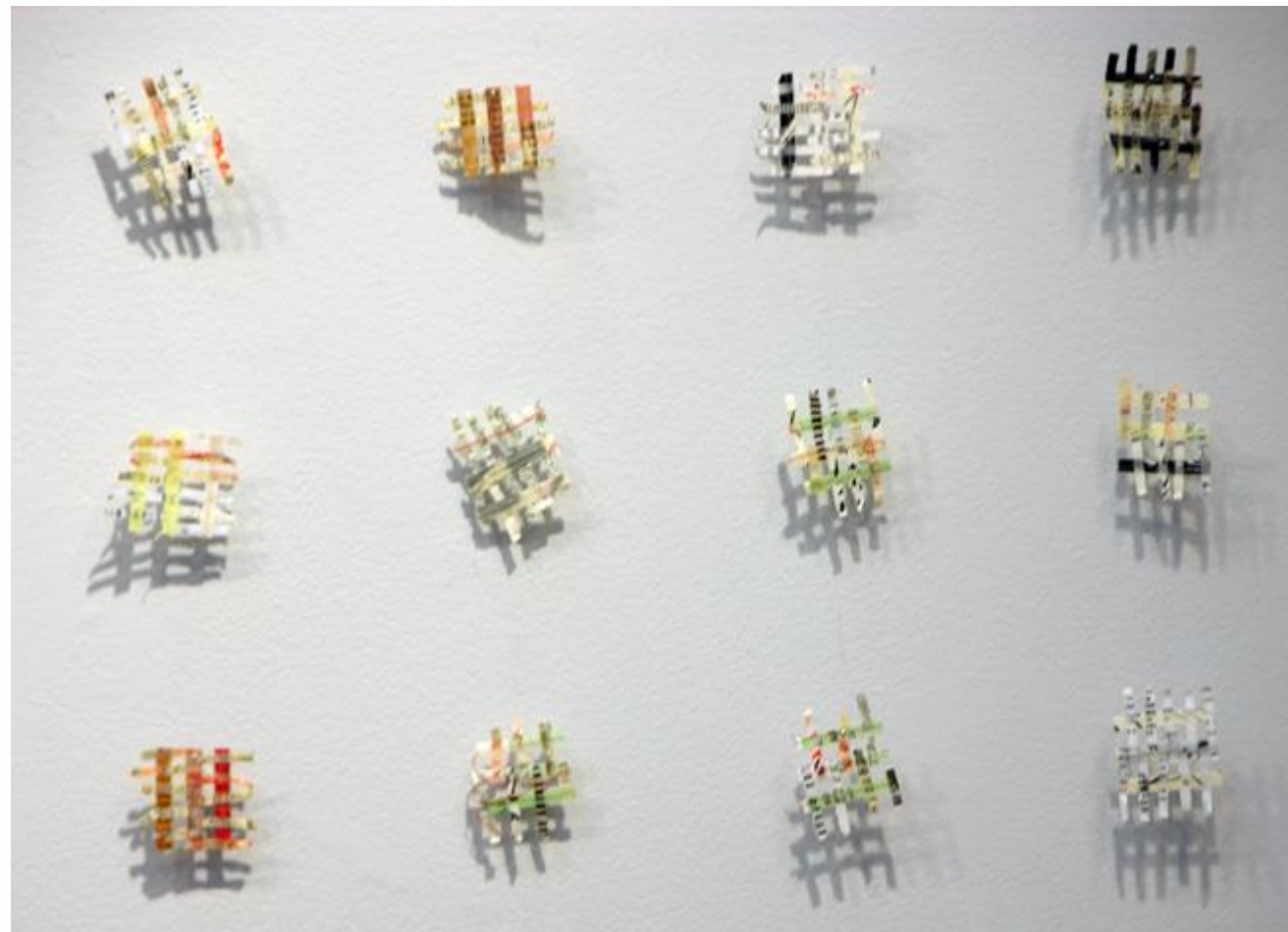
Shadow Language , Daniella Woolf