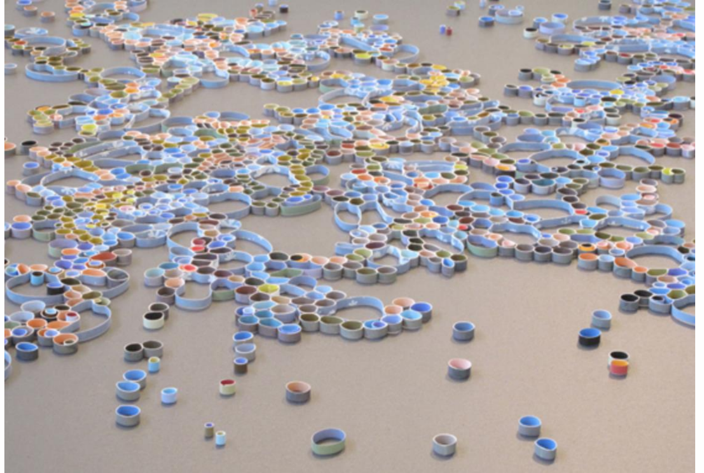
Oil Slick , Michelle Forsyth