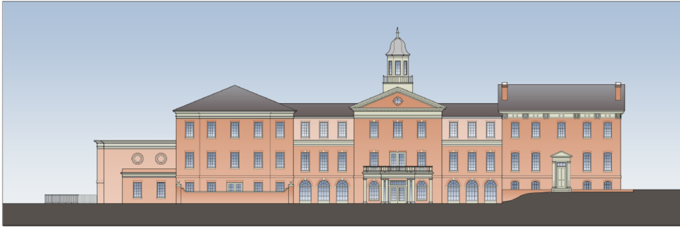
SOUTH (FRONT) ELEVATION