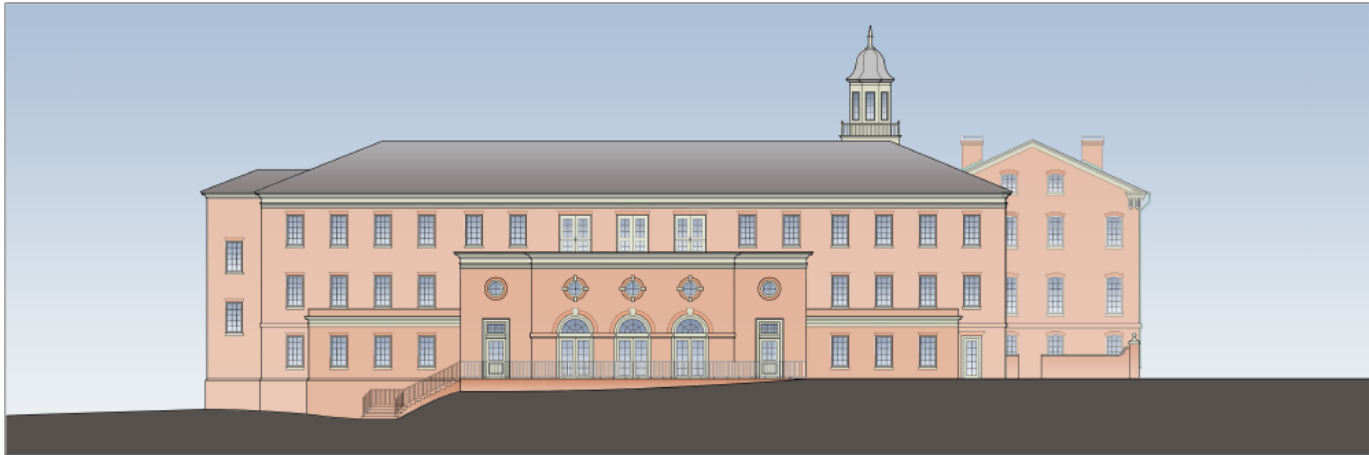
WEST (SIDE) ELEVATION