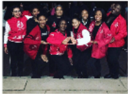
National Pan-Hellenic Council (NPHC)