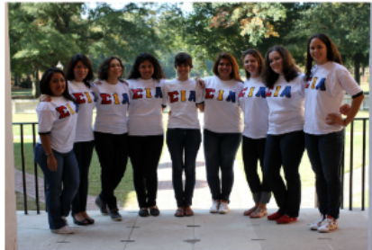
Founding sisters of SIA (above, 2013) and DPO (left, 2016)