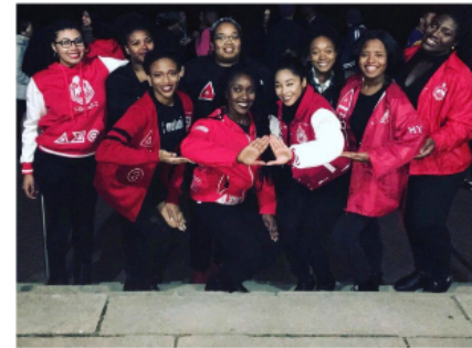
National Pan-Hellenic Council (NPHC)