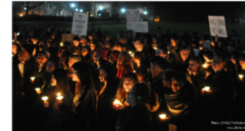
No Ban, No Wall Rally, Feb. 2

"People care about the issues but just don't know how to engage in conversation."