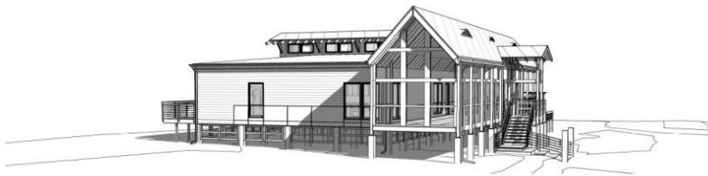
view approaching on atlantic street