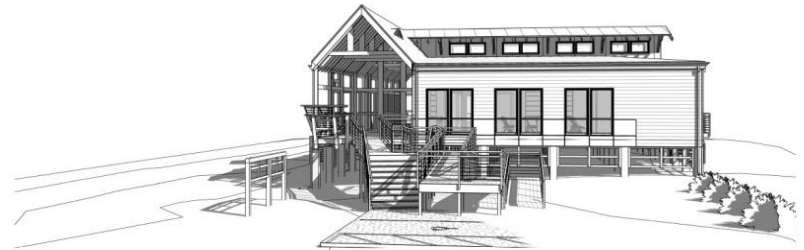
view from administration building