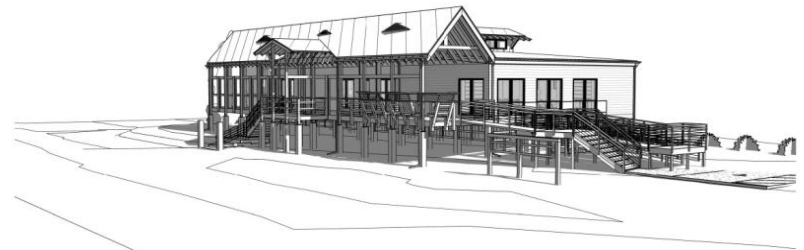
view from hatchery