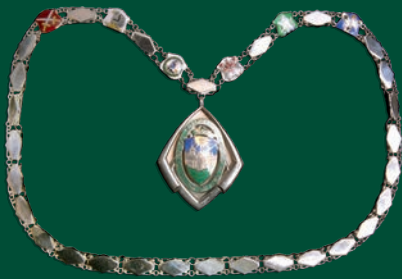
CHANCELLOR'S BADGE & CHAIN