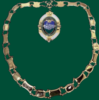
PRESIDENT'S BADGE & CHAIN