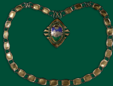
RECTOR'S BADGE & CHAIN