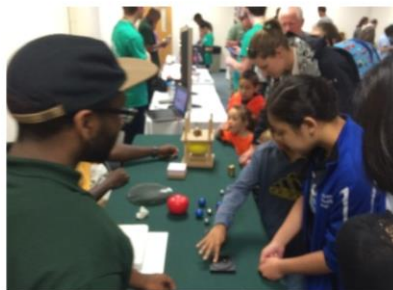
More excited children.