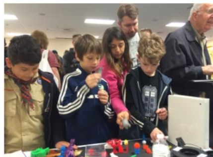
Many enthusiastic children stopped by our table.