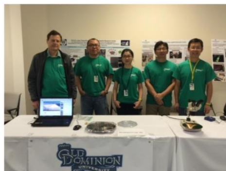
Old Dominion University display table.