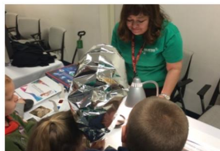
Song showing an optical illusion.