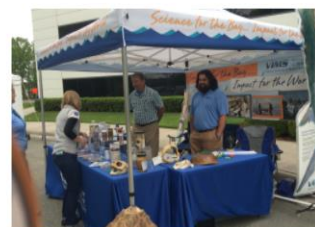
Virginia Institute of Marine Science outdoor display table.