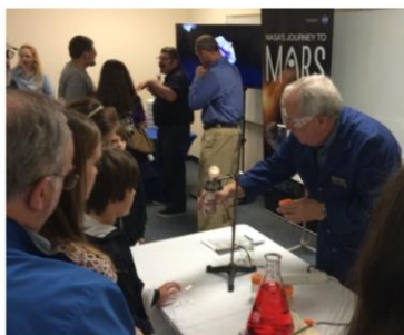
Norfolk State University demonstration.