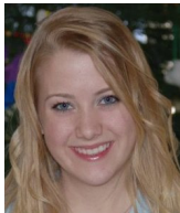
Mcghan Poszy Inventory