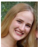
Alexis Kuiper Resources