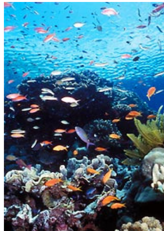
One of our new BBB's will take your residents on a tour of life in the ocean deep. Check it out!