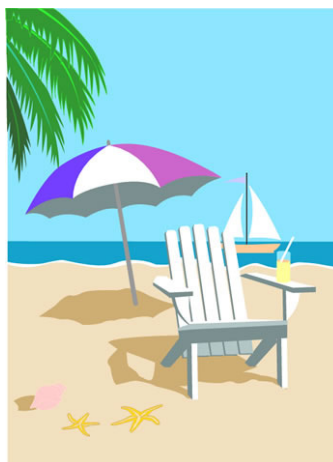
From all of us at the PRC: Have a great summer!

We're moving! Due to fire safety updates being installed in Dupont hall, this summer the PRC will be located in one of the Lodges. It will be a slightly smaller space with a very different layout, but we believe in Tim Gunn's philosophy: "make it work!" Don't worry, the PRC will be moved back into Dupont basement before fall RA training begins in August.