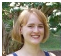
Alexis Kuiper Resources