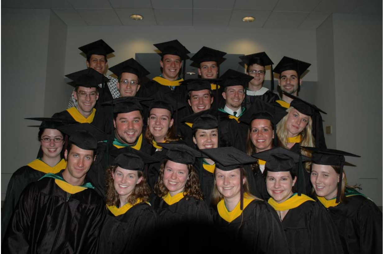
Class of 2005 in mathematics (May 2005)