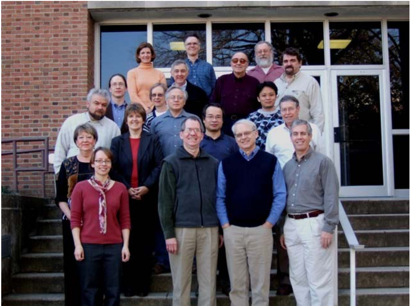
William and Mary Mathematics Faculty Group Photo (Fall 2005)