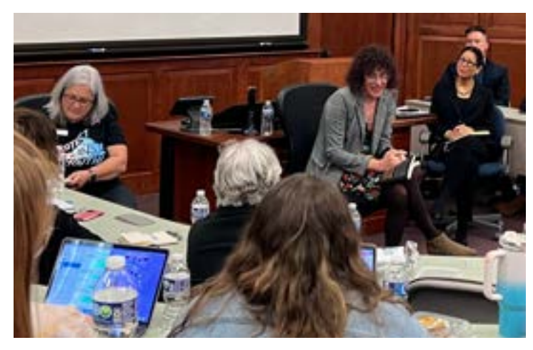
Trans Youth Panel in Session

With GSWS and W&M's Center for Racial and Social Justice, in partnership with BLSA, NLG, and If/When/How