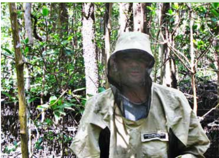
Sampling takes place in full mosquito gear in the mangroves