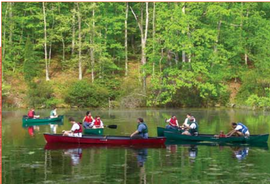
Students canoe on Lake Matoaka in front of the Keck Lab.