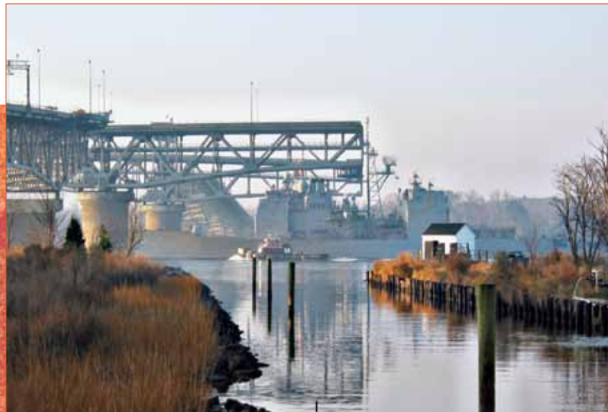
Virginia Institute of Marine Science at Gloucester Point.