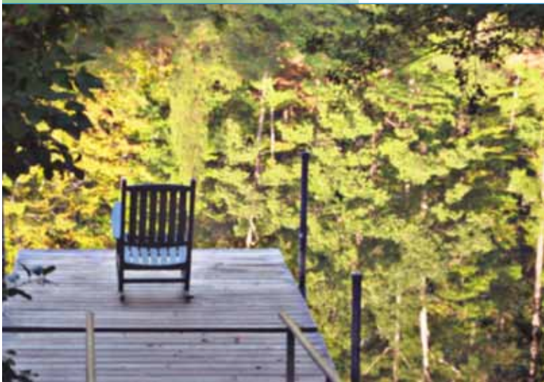
Sittin' on the dock by the lake.